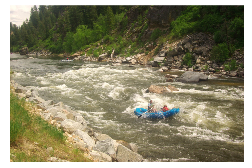
East Fork of the Payette River, late May, 2010

This newsletter is produced semi-annually as a part of the Consumer Finance Bureau's continued communication outreach with the companies it regulates. Delivery is provided by electronic notification of its availability on the Department's website at <a href="http://finance.idaho.gov">http://finance.idaho.gov</a>.